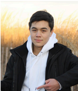
Hiroko Fujita and Paul Fukami Scholarship