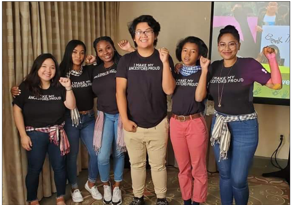
Alliance of Rhode Island Southeast Asians for Education (ARISE) team members