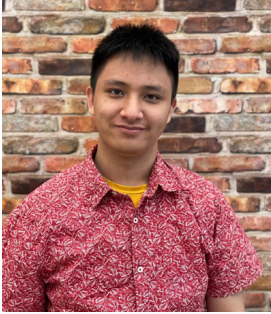
Tama (Yoshimura) and Jiro Ishihara Scholarship