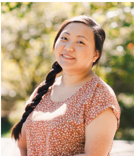
Ryozo Glenn Kumekawa Scholarship