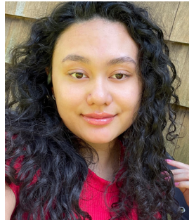
Yutaka and Maureen Kobayashi Scholarship