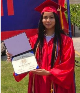
Hisaye Hamaoka Mochizuki Scholarship