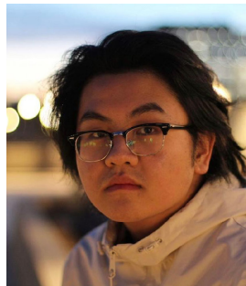
My Immigrant Ancestors Scholarship

"Education isn't all about school, it's about understanding and taking criticism from others to better oneself. ... Growing up with nine siblings I was definitely educated about the outside